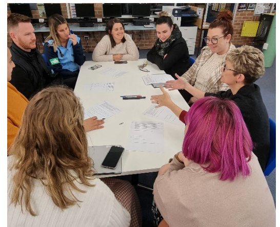
TEACHERS DISCUSSING PARENT SURVEY SUGGESTIONS